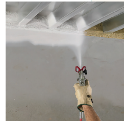
HEAD OF WALL