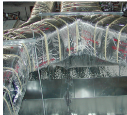
PASSIVE FIRE WRAPS