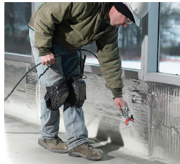
EDGE OF SLAB